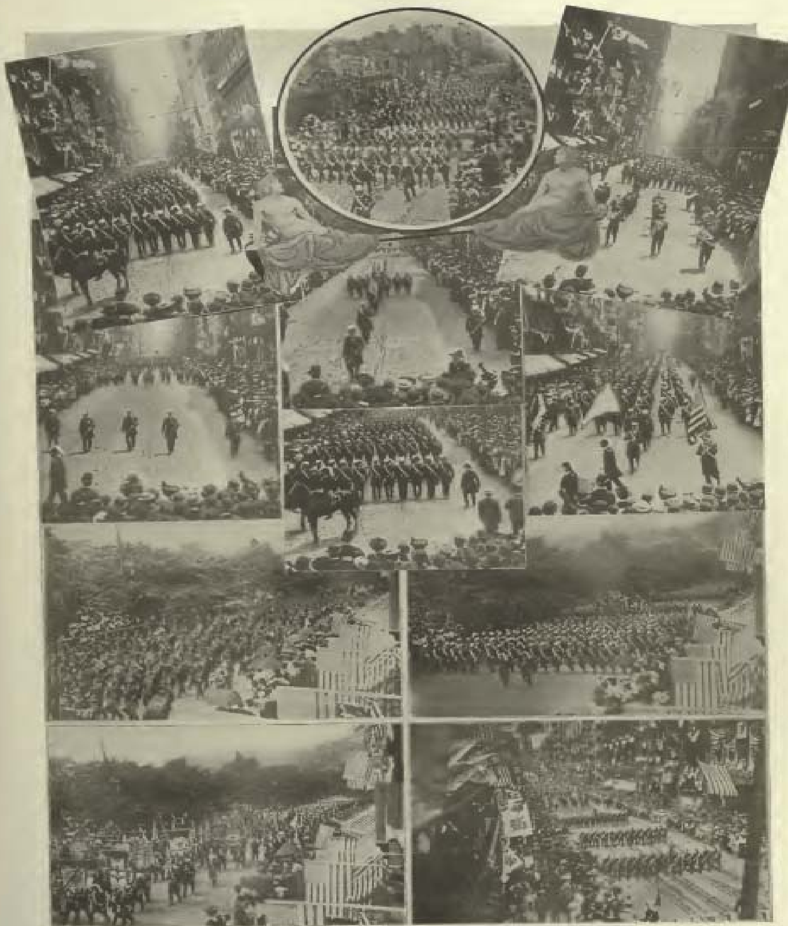
KNIGHTS TEMPLAR PARADE.